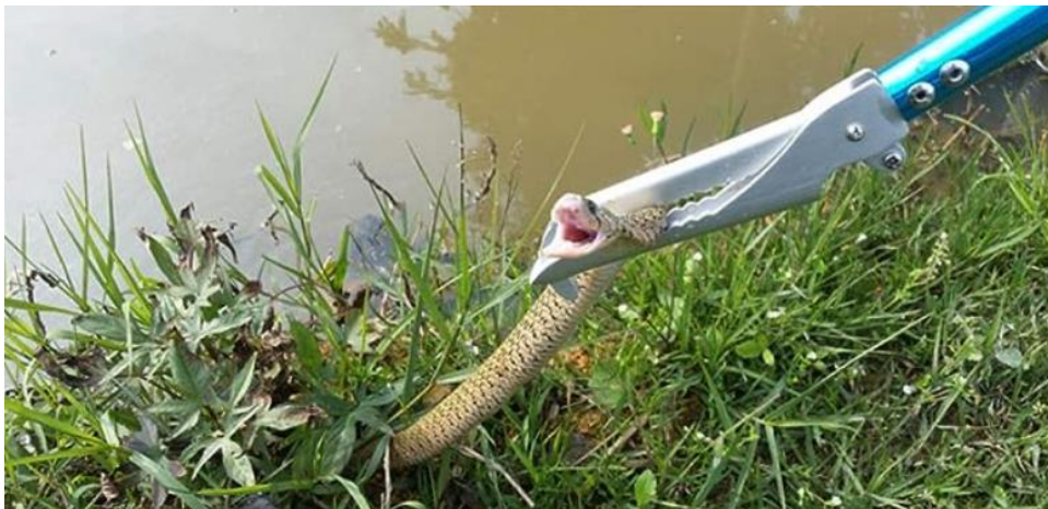
Figure 2: A snake being caught by a long handling tong (Ouronehome, n.d.).

These are also called grabber tongs or snake tongs. These are best used to catch snakes, cats, and other small animals around the neck or body, as seen in Figure 2 (Ouronehome, n.d.).