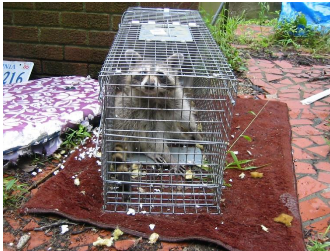
Figure 4: Raccoon captured in a live trap (CJS, 2007).

When providing traps to the public, ask them not to set the traps unless they can attend to and care for the animal in a timely manner.