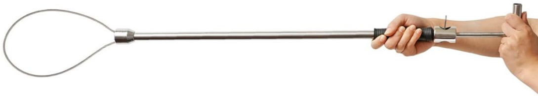
Figure 1: Catch Pole (Junniu, n.d.)

Catch poles and snares are often used and come in all styles and lengths. They have a stiff handle with an adjustable loop of rope or cable on one end as seen below in Figure 1 (Junniu, n.d.). Keep them clean, properly stored, and in good condition.