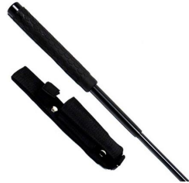
Figure 3: Expandable Bite Stick (ACES, n.d.)

A bite stick gives the attacking animal something to bite beside the officer. A bite stick is most effectively used as a distraction to fill the dog's mouth, preventing the animal from biting. It also may be used as a pry tool at the back of a dog's mouth to make the dog release its grip once it has bitten.